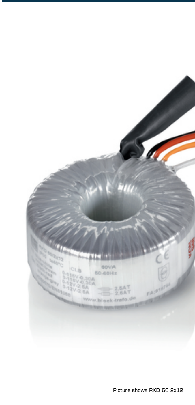
Picture shows RKD 60 2x12